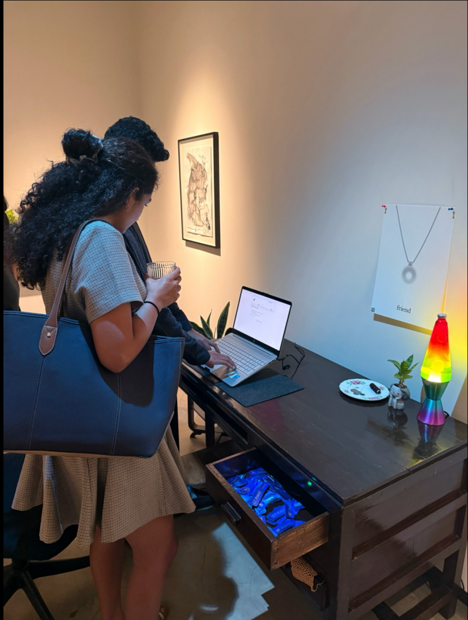
Installation view of 'Chrome Dino Game' and 'Poked' from 'It's Taking longer to download that it was to puke up' at Fulcrum, Bombay

Alongside these digital traces, drawings on the wall introduce another mode of communication. Abstract mark-making echoes her attempts at self-expression, positioning bodily gestures as a parallel to digital inscriptions. Across the installation, Lohani holds in tension the network's dual conditions: the somatic and cognitive, the user and software, the human and nonhuman.