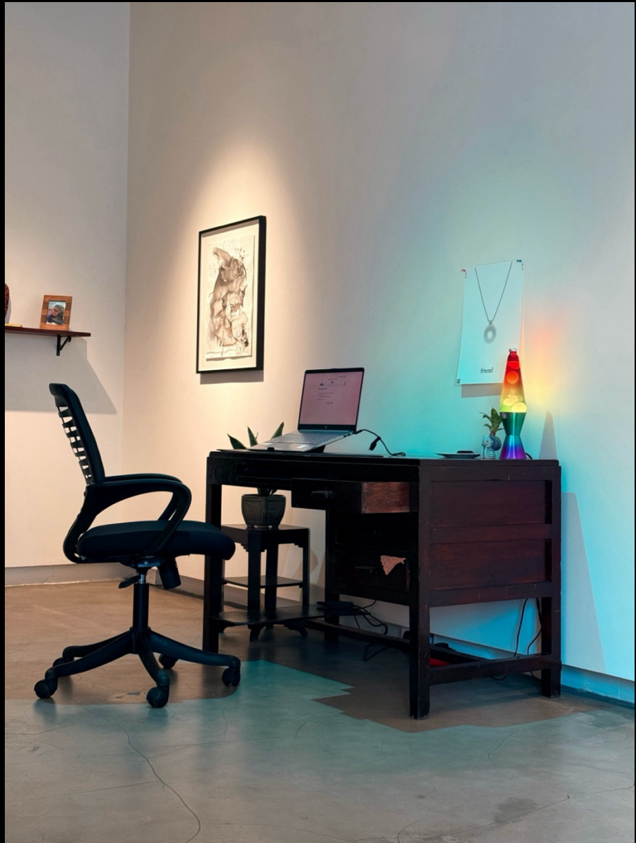
Installation view of 'Chrome Dino Game' and 'Poked' from 'It's Taking longer to download than it was to puke up' at Fulcrum, Bombay