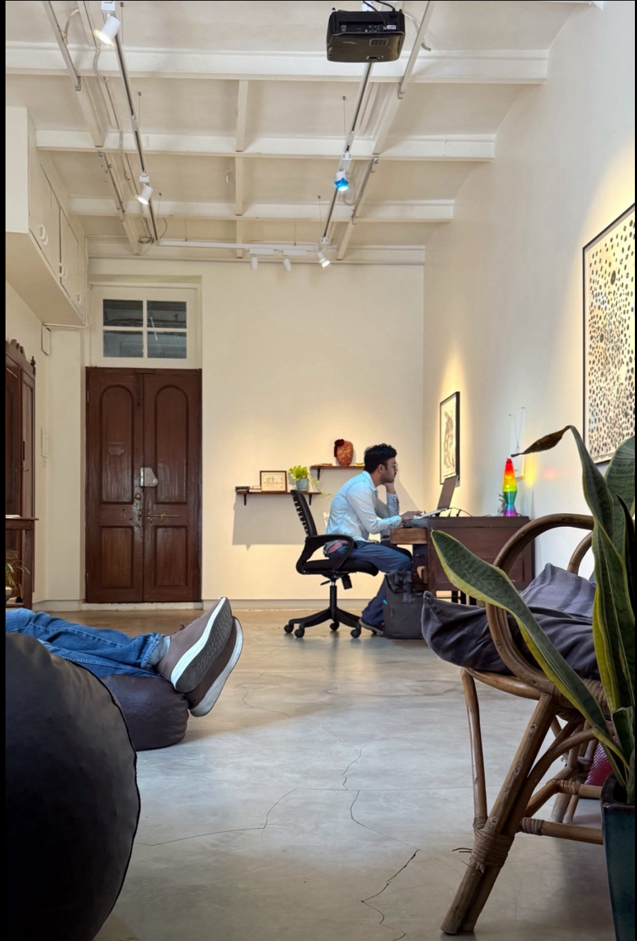
Installation view from 'It's Taking longer to download that it was to puke up' at Fulcrum, Bombay